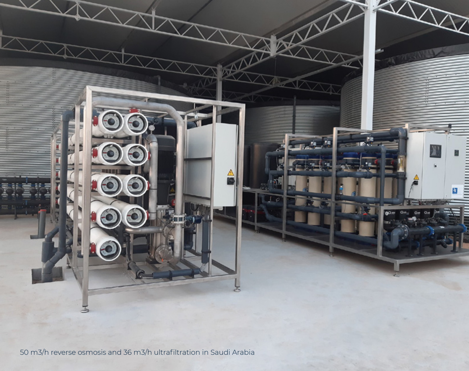
50 m 3 /h reverse osmosis and 36 m 3 /h ultrafiltration in Saudi Arabia

We go above and beyond to help you with everything water related!