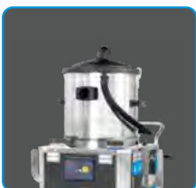
Vacuum cleaner with 14 liters vacuum drum and drainage hose Steam Power Plus only