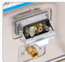
Steam outlet 10 bar - 12P and high pressure water outlet