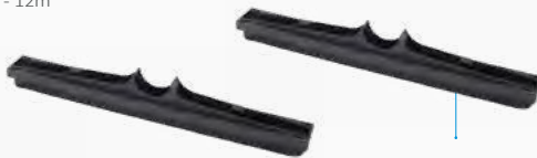
Brush/squeegee insert - 2pcs L. 375mm