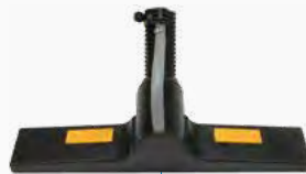
Floor tool L. 375mm