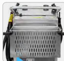
Accessory basket and cable holder