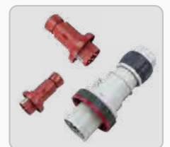
Electric plug with 8m cable: IEC309/16A Mod. 10,8 kW IEC309/32A Mod. 14,4 - 18 - 21,6 kW IEC309/63A Mod. 28,8 - 36 kW