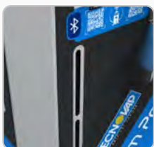
Water tank level indicator