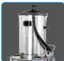
Vacuum cleaner with 43 liters vacuum drum and drainage hose