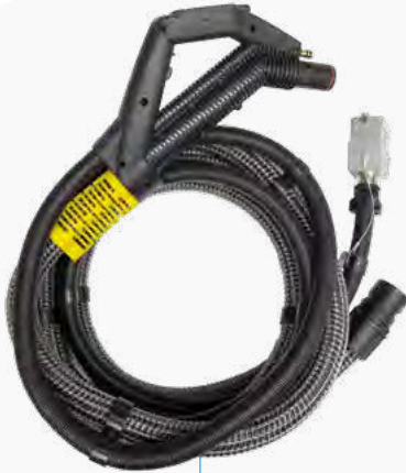
Steam/vacuum hose with control panel 4m - 8m - 12m