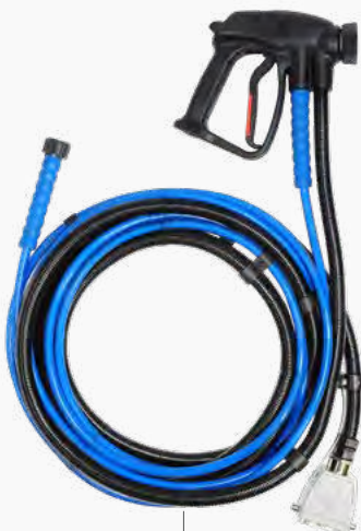
Steam/water hose 5m - 8m - 10m - 15m