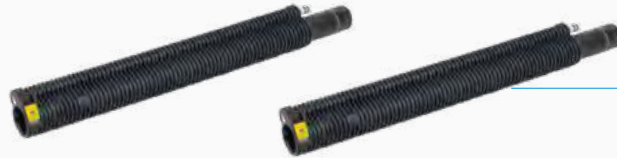
Extension tubes - 2pcs L. 480mm