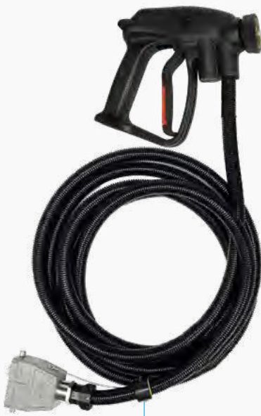
Steam hose 5m - 8m - 10m - 15m