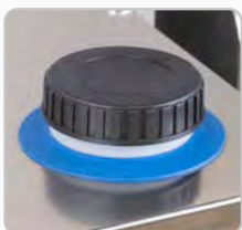
Water tank 14 liters