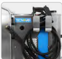
Hose holder, lance holder and high pressure pump level indicator (accessories not included)