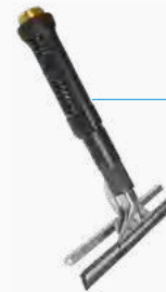
Lance with window cleaner & diffuser 250mm - 350mm - 450mm