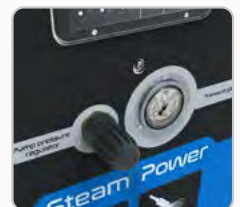
Pump pressure regulator and analogic pressure gauge