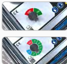
ON/OFF switch Power regulation switch