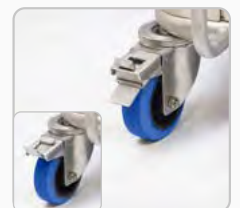
Anti-scratch rubber wheels 360° with safety brakes