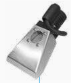
Stainless-steel upholstery tool