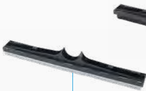
Squeegee/squeegee insert L. 375mm