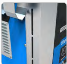
Detergent tank level indicator