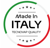
Steam Power Plus