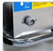
Water mains connection