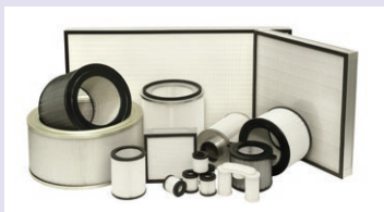
HEPAfine & ULPAfine