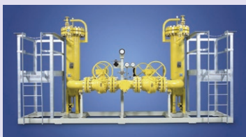
Engineered Filtration Equipment