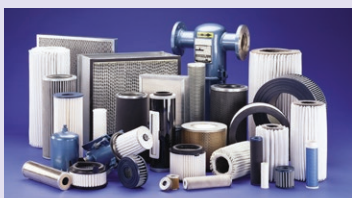
Standard Filter Product