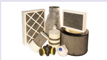
PLEKX Composite Web Media