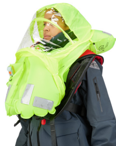
Inflated with sprayhood