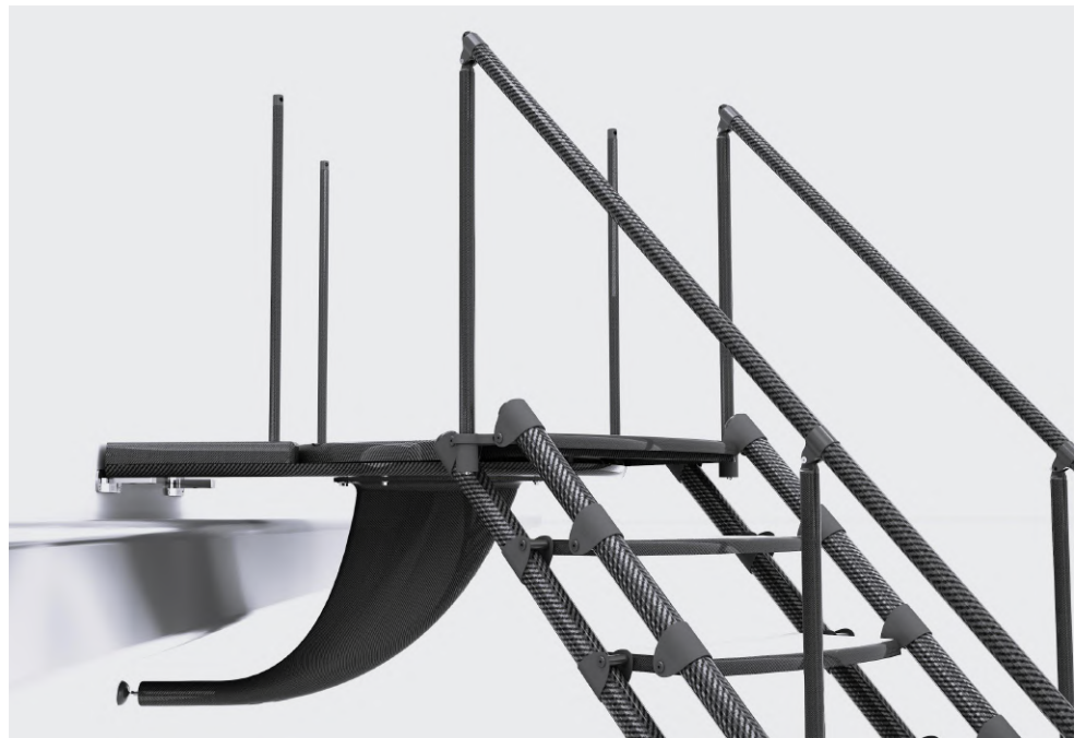
The turntable platform, Turner Boarding Ladder

This is a much easier process than installing the whole system in one go, avoiding to handle a very large and articulated piece of equipment.