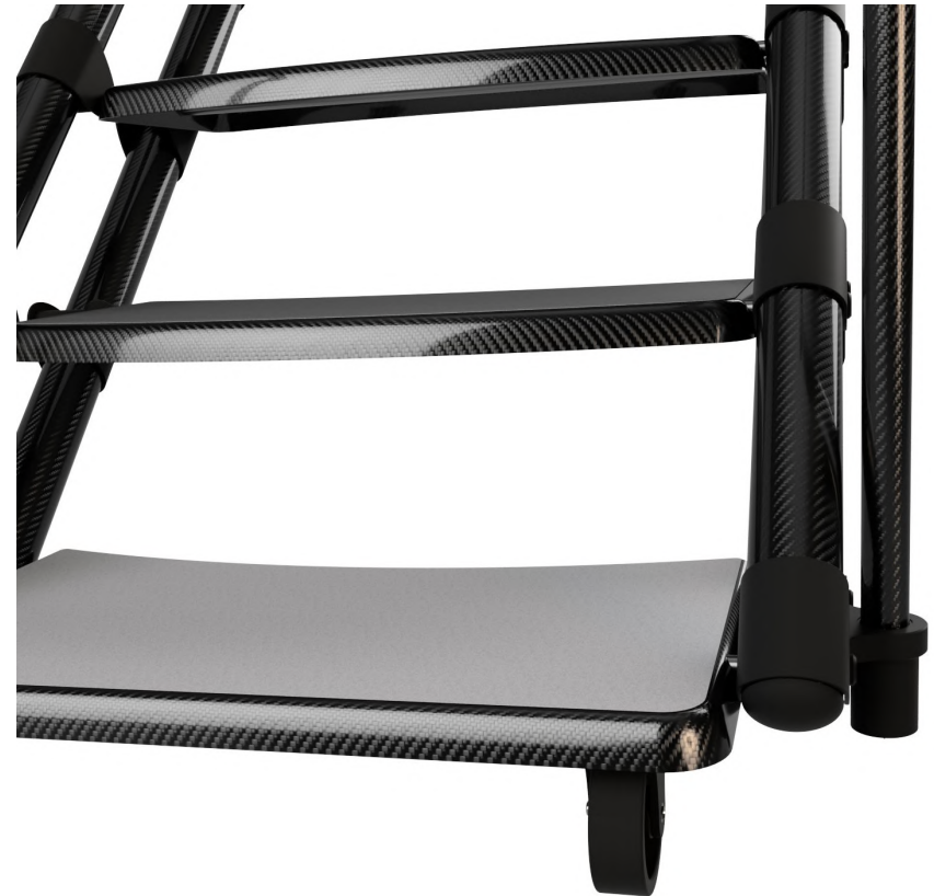
The handrails on both sides are designed to leave the surface free to walk on