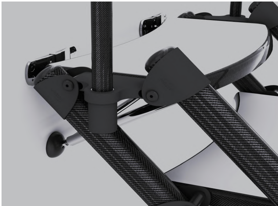
The fixed top platform, Pollock Boarding Ladder

The optional handrails are added last, with quick release pins.