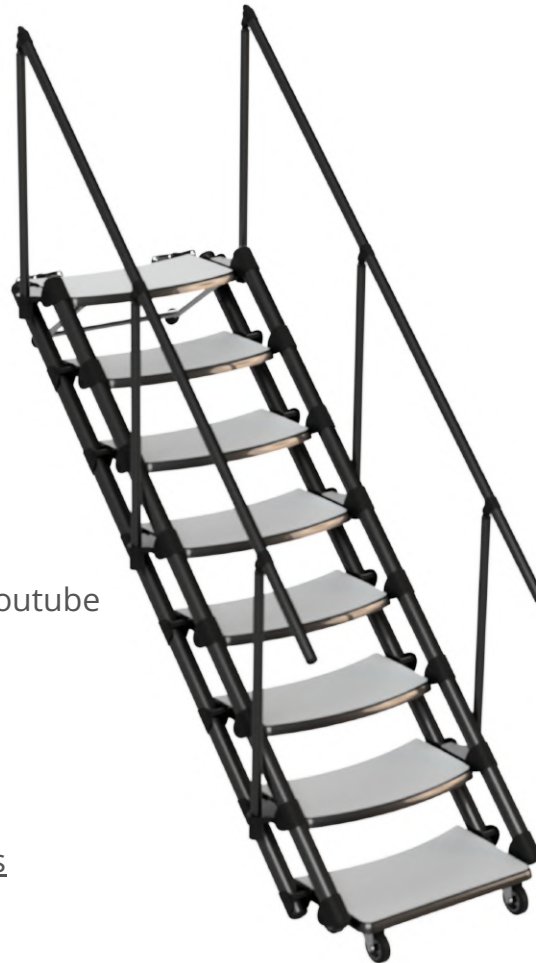
The self levelling surface, at maximum angle

https://www.youtube.com/watch?v=0LFMApCG4bw