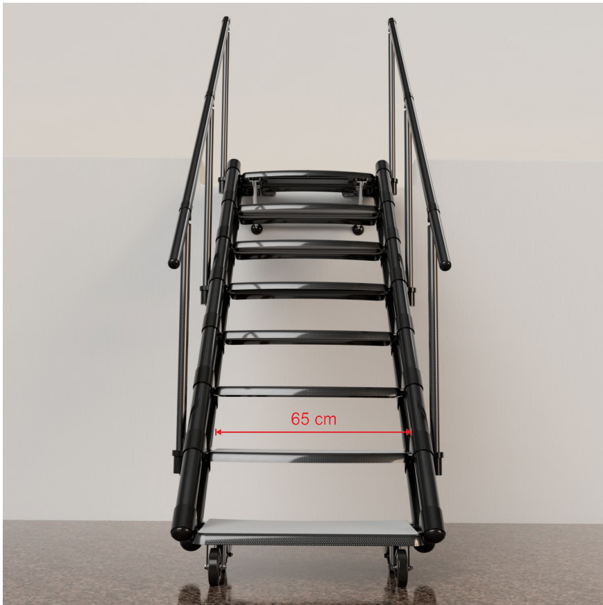
65 cm wide steps, in grey non-slip surface

The optional carbon fiber handrails are positioned on external supports, leaving the steps surface completely free to walk on .