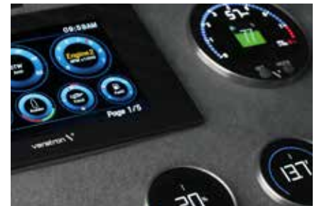
The VMH series look and feel gives an elegant and stylish touch to your dashboard