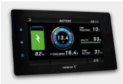
Intelligent Battery Sensor (IBS) screen to keep your energy supplies under control

The embedded NMEA 2000® gateway brings all the sensor readings and alarms to your external multifunctional display, saving the cost of an additional converter.