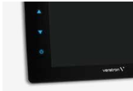
Lateral touch buttons are RGB illuminated and allow for a quick brightness adjustment