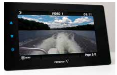
Every place of the boat is under your control thanks to the dual video input