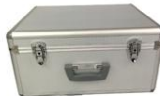
Protective Alu-transport box