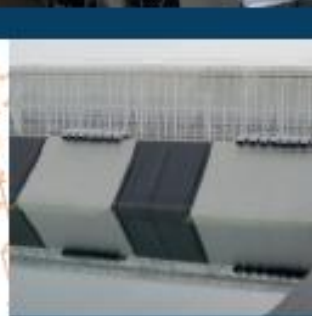
▲ rain water reservoir