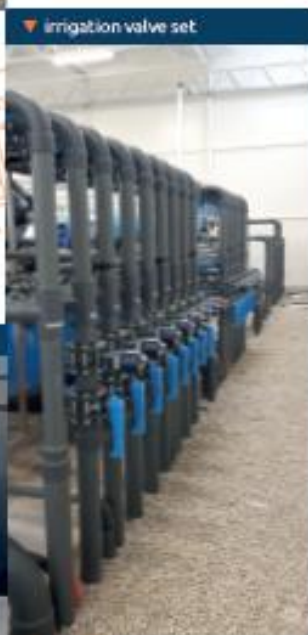
▼ irrigation valve set