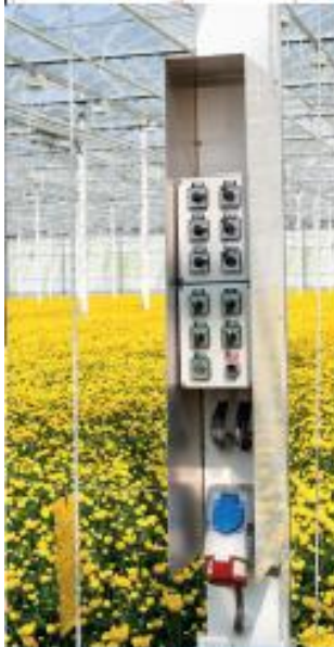
▲ pathway receptacles