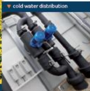
▼ cold water distribution