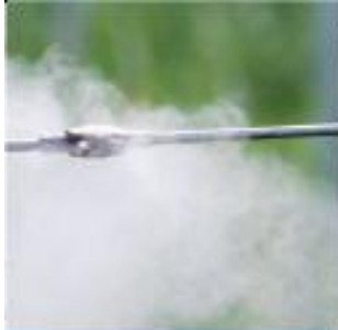
▲ fogging system