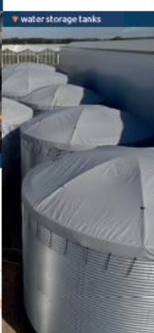
▼ water storage tanks