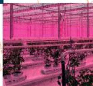
▲ LED systems