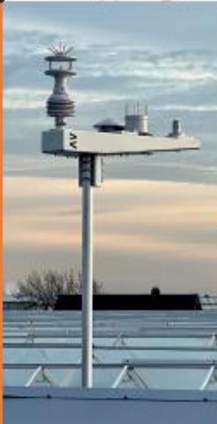
▲ meteo station