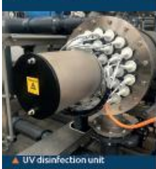
▲ UV disinfection unit