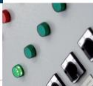
▲ switch panel