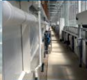
▲ semi closed system