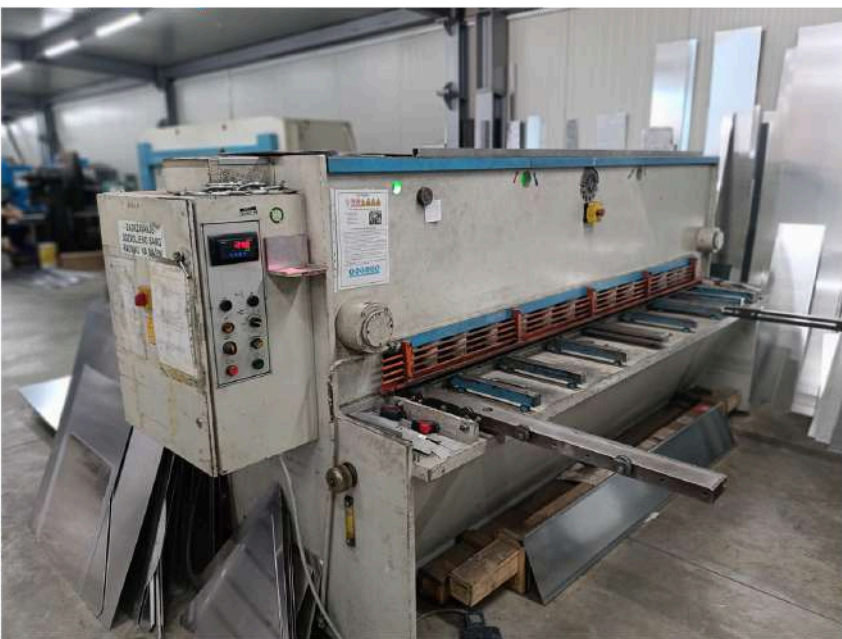
Hydraulic sheet metal cutters max. sheet metal width: 2.5m max. thickness: 4mm steel