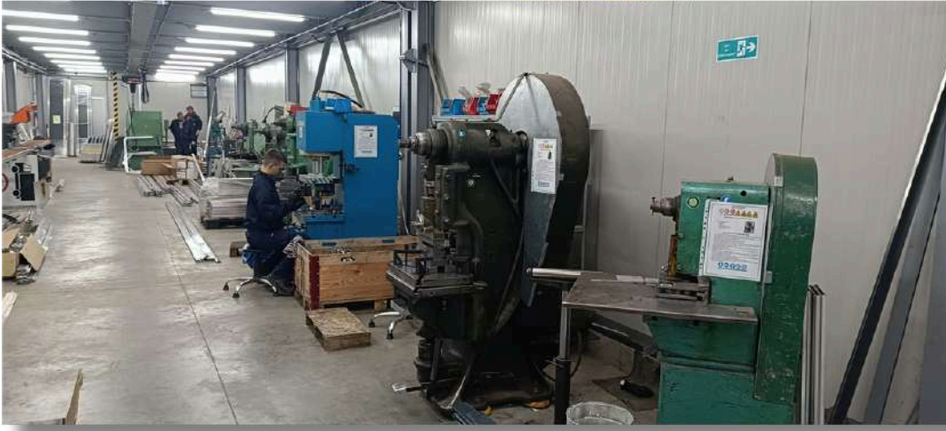
Various metalworking machinery