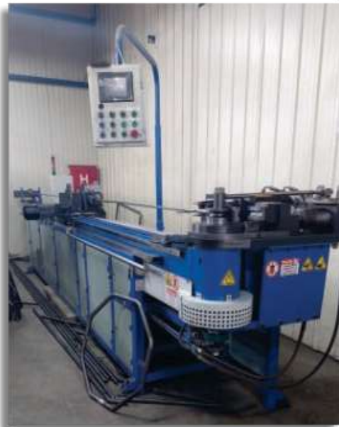
CNC Machine for tube bending Maximum tube length: 6000mm Tube diameter: 3/4"