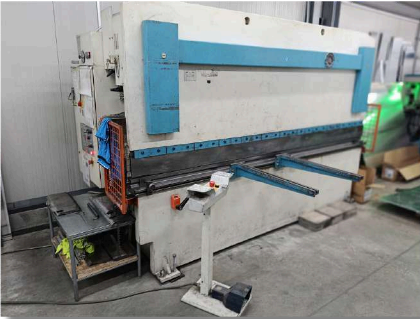
Hydraulic press brake max. length: 3m max. thickness: 4mm steel