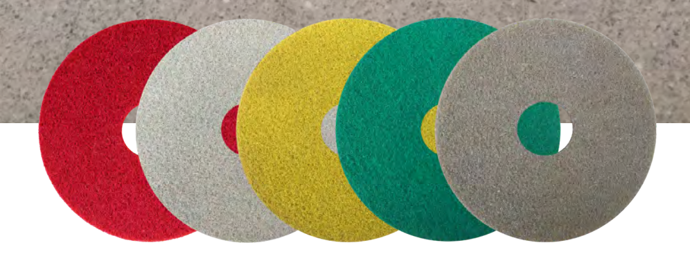
400 GRIT | 800 GRIT | 1800 GRIT | 3500 GRIT | 8000 GRIT

Professional range of pads with flexible material to deep clean, upgrade and maintain all types of coated and uncoated, hard and resilient floors.