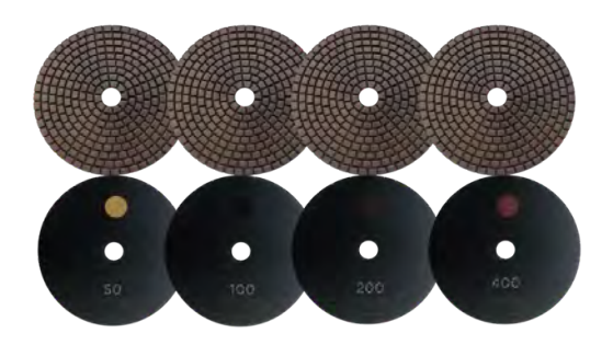
50 GRIT | 100 GRIT | 200 GRIT | 400 GRIT