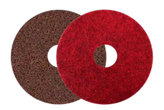
220 GRIT | 400 GRIT