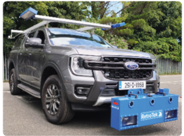
Survey vehicle with Qd system (roof) and D system (front)

The RetroTek-QD is the latest innovation in road condition surveys leveraging developments in lighting and camera technology with advanced software algorithms to accurately measure \beta and Qd luminance of road markings. The system can measure white/yellow and dash/continuous markings on asphalt/concrete by day/night in dry conditions. It is securely fitted to a vehicles roof racking system using the brackets supplied.