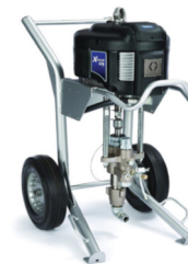
GRACO XTREME 70:1 PNEUMATIC PUMP