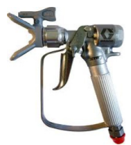
XTR-7 Airless Spray Gun