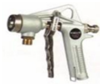
GNG/T3005 Texture Gun Bottom Entry