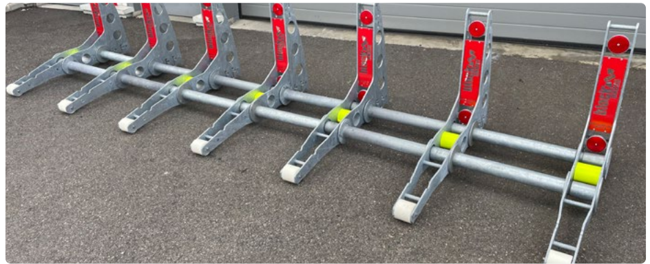
With two rows of tubes for enhanced impact resistance

Easy to store and stock on its storage rack