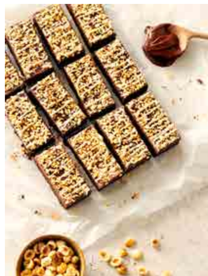
NUTELLA AND HAZELNUT