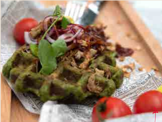
Curly kale waffle with pulled pork and BBQ sauce

READY-MADE BATTER THAT ENABLES YOU TO BAKE THE MOST DELICIOUS VEGETABLE MUFFINS & WAFFLES IN NO TIME.