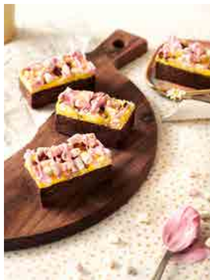
MARSHMALLOW ROCKY ROAD