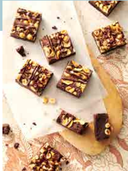
NUTS & CHOCOLATE