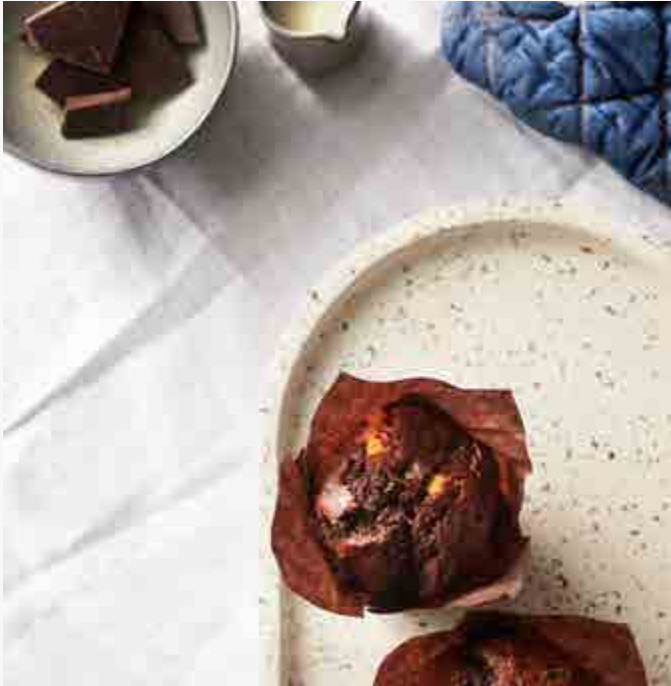
DOUBLE CHOC MUFFIN