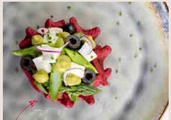
Beetroot waffle with green asparagus, feta, olives and avocado cream