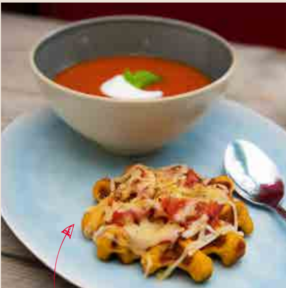
Serve your soup with a mini-pizza waffle for a change!