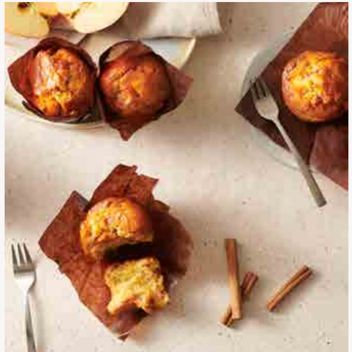
APPLE & CINNAMON MUFFIN