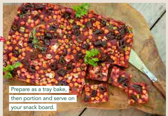
Beetroot batter with goat cheese, figs and spring onion.

Prepare as a tray bake, then portion and serve on your snack board.