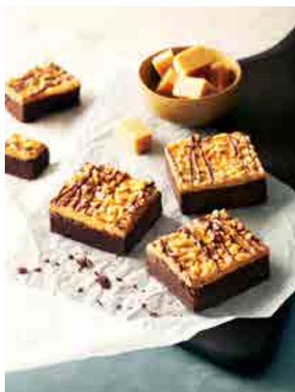
CARAMEL & DARK CHOCOLATE