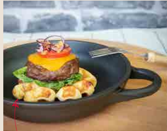
The waffle burger! How cool is that!