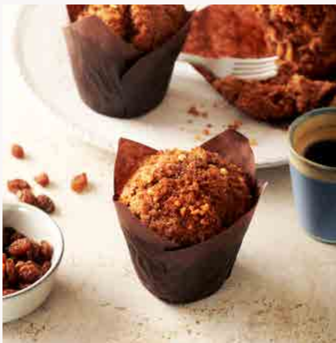
SPICE & RAISIN