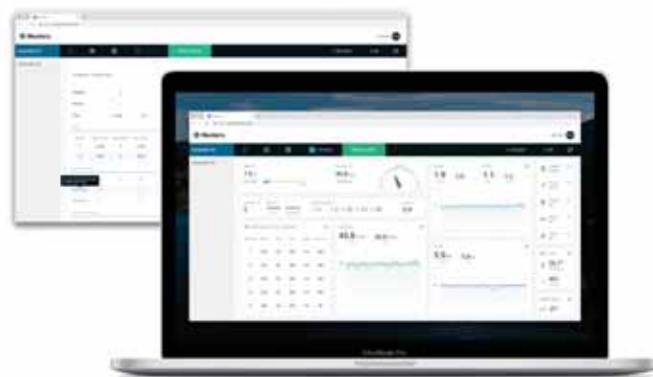
GreenField App dashboard - Desktop view

Munters GreenField App, an advanced app used to connect to Munters GreenField or GreenField ECO controllers, enables full management over the irrigation and fertigation operations.