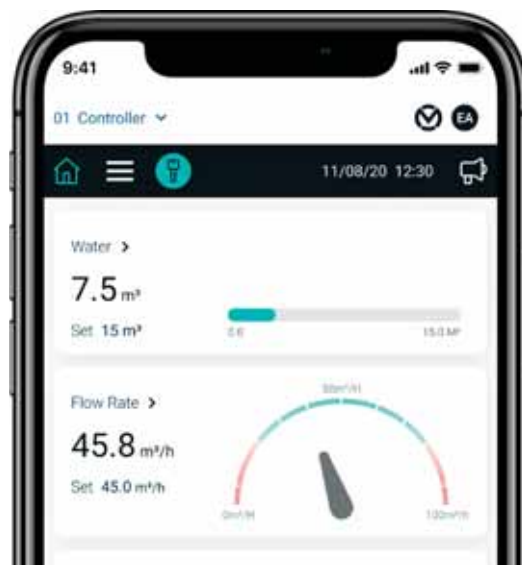
GreenField App dashboard - Mobile view

In the unfortunate case of errors, Munters GreenField App features a rich diagnostic package that makes troubleshooting an easy task.