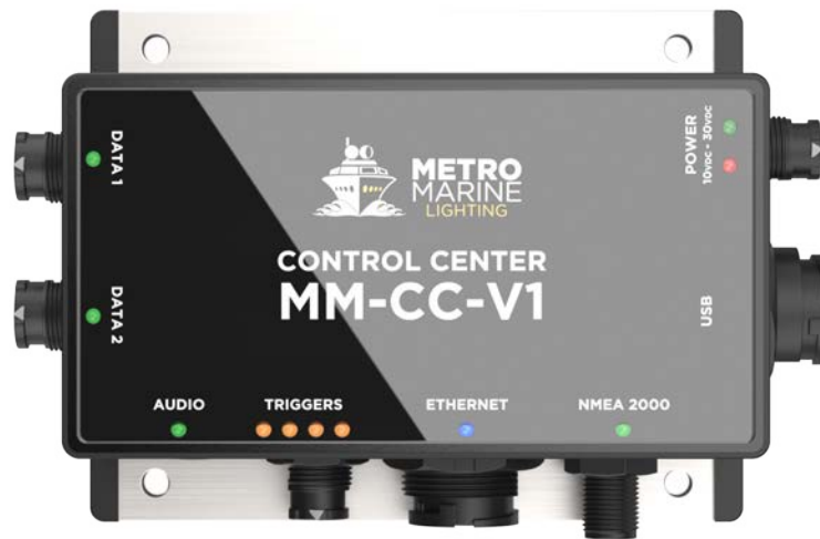
Metro Marine Control Center (Top View)