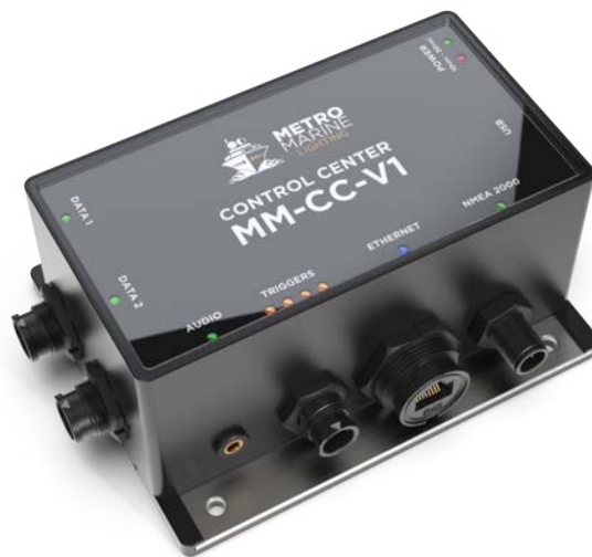
Metro Marine Control Center (Perspective View)