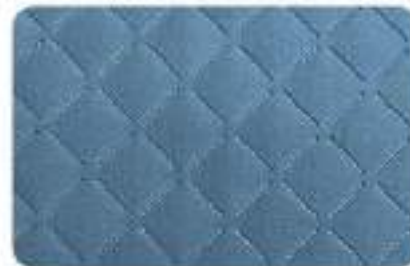
ROMBO FINA CUCITURA fini diamond pattern MISURE DISPONIBILI available sizes: 21,2 - 41,8 - 83,3 cm