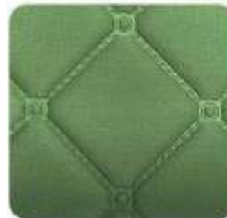
ROMBO CARTONNI FINA CUCITURA fini diamond pattern MISURE DISPONIBILI available sizes: 5,5x5,5 cm