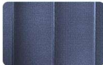
RIGA LISCIA flat line MISURE DISPONIBILI available sizes: 2,5 - 3 - 4 - 5 - 6 - 9 - 10 - 12 - 15 - 20 cm