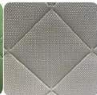
ROMBO ANGOLO BETTO LISTO flat diamond MISURE DISPONIBILI available sizes: 8x8 cm