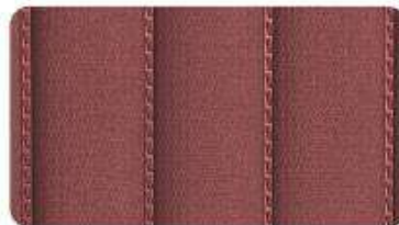
RIGA FINTA CUCITURA falsk stitching line MISURE DISPONIBILI available sizes: 3 - 4 - 5 - 6 - 10 cm