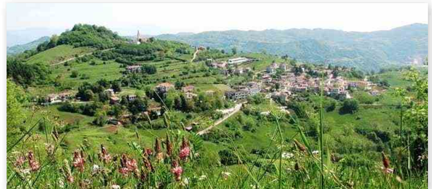
Bolca is a village in the Veneto, on the southern margin of the Italian Alps.