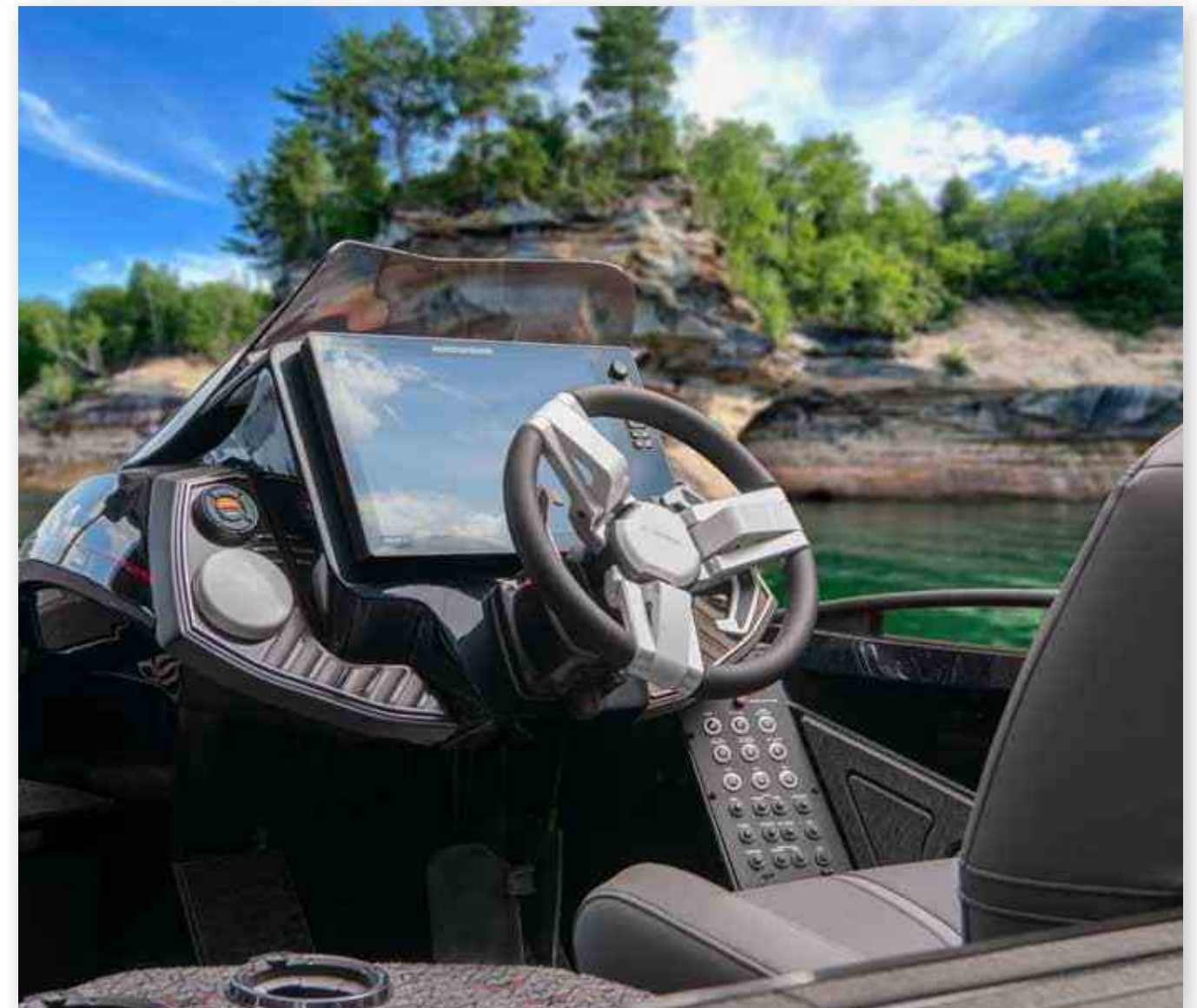
Custom boat design for Vexus, featuring the Progno wheel with white spoke inserts.