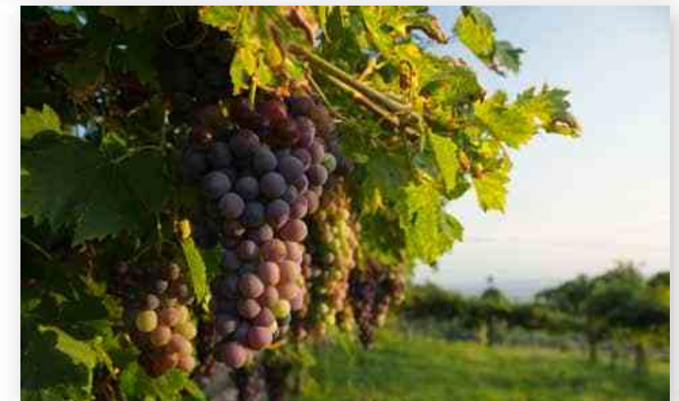
Corvina Veronese wine grapes in the Veneto region of northeast Italy