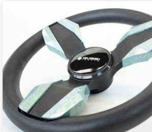
Collina "S", Custom Color & Texture

Beautiful, durable, and available in over 60 gorgeous designs, Gussi Italia wheels are rugged enough for the rigors of boating, yet refined enough to sit among Italy's greatest masterpieces. They turn effortlessly within a captain's hands, providing exceptional control, quick response, and an impressive grip. We guarantee that once you get your hands on a Gussi Italia, you'll never want to let go.