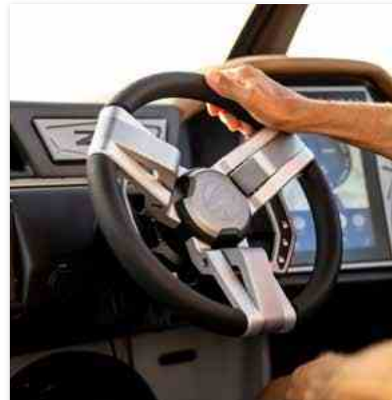
Progno in Brushed Aluminum

An incredibly new and modern look in boat steering! Six machined aluminum spokes with three custom color anodized accent spokes support the sturdy aluminum leather or soft grip wrapped wheel. Match accent spokes with boat colors for an amazing look!