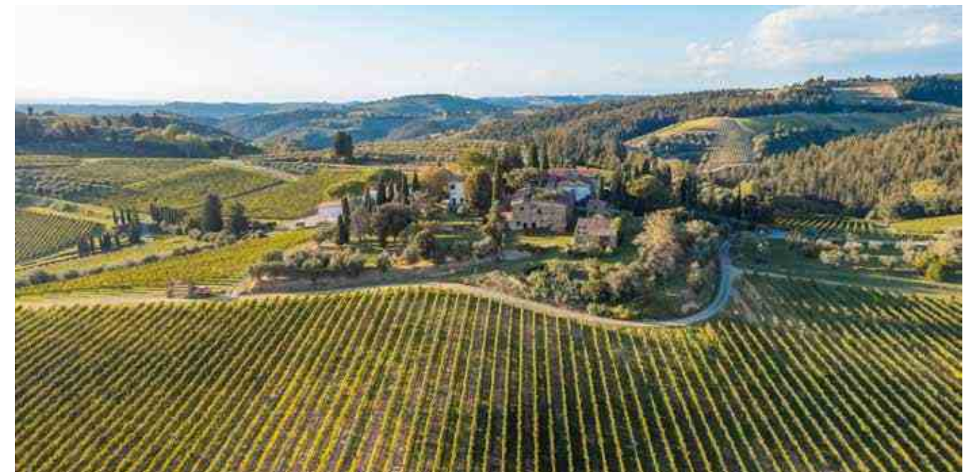
Panorama of vineyard with farmhouse in the hills typical of Tuscany

Same timeless design as Collina L with three unique accent inserts. Sturdy and all weather resilient molded polypropylene soft grip wheel, Collina S offers your choice of three interchangeable insert options: Black, Chrome, and Matte inserts.