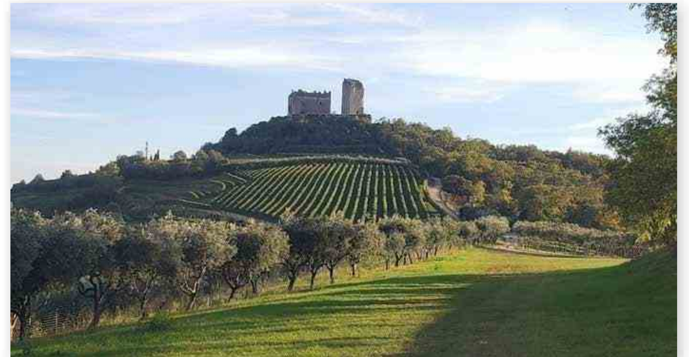
Also called Castello Scaligero, the mostly intact remains of this 1000+ year old castle still majestically rise above the town of Illasi.