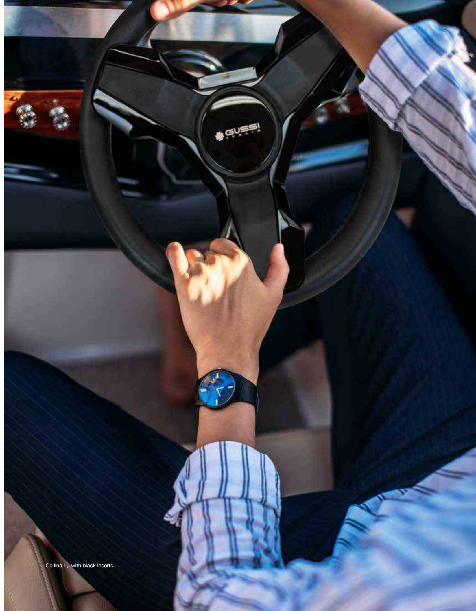
Collina L, with black inserts