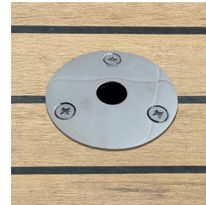
Flush Fitting Padeye