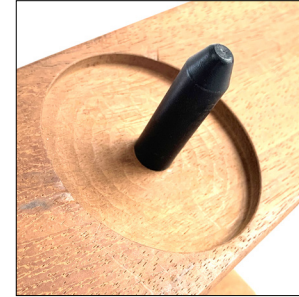
Recessed in the base