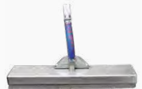
Steam brush with bristles 250mm - 350mm - 450mm to be connected to the Geysier lance