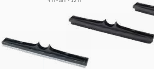
Squeegee/squeegee insert L. 375mm