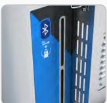
Detergent tank level indicator