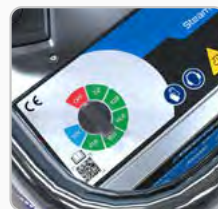
Power switch regulation