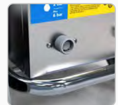
Water mains connection