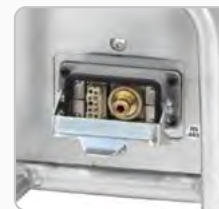
Steam outlet 10 bar - 12P