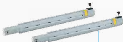
Extension tubes L. 480mm