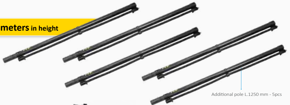
Additional pole L.1250 mm - 5pcs