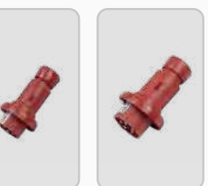
Electric plug with 8m cable: