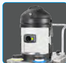
Vacuum cleaner with brush motors