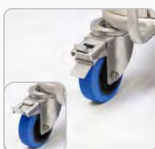
Ruote anteriori in gomma anti-traccia 360° con freno di sicurezza