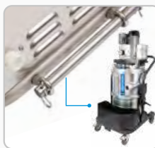
Hook for Vac Industrial (not included)