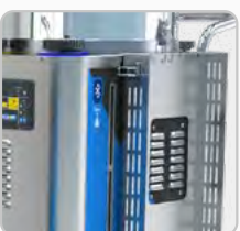
Accessory basket and extension tube holder