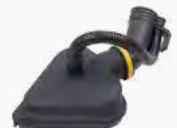
Steam+vacuum triangular brush *