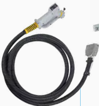
Steam hose 5m - 8m - 10m - 12m