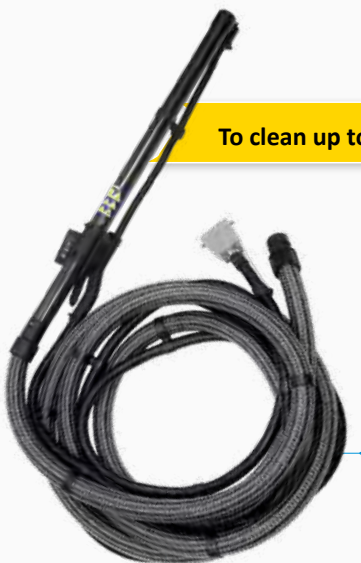
Initial pole L.950mm with control panel & steam/vacuum hose 6m or 8m