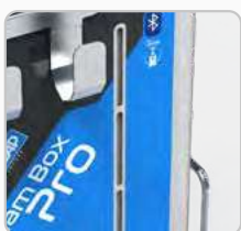
Water tank level indicator