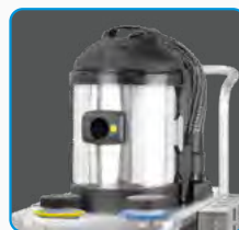
Vacuum cleaner with induction turbine