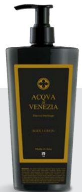
ADV012 Body lotion