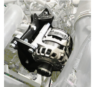
2025 Isuzu NPS 300 Special bracket for engine As well as frame change