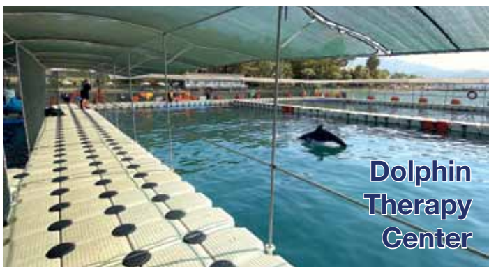
Dolphin Therapy Center