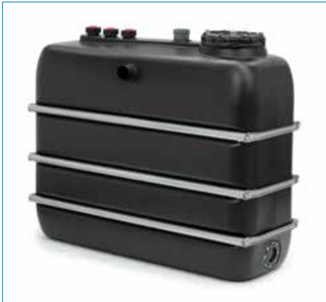
Basis tank 2,000 liters