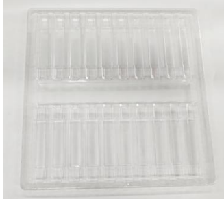
一托盘 20 个模组 20 modules in a tray