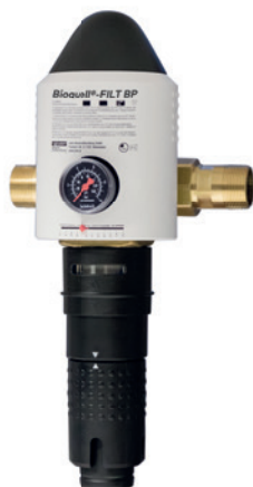
Type Bioquell®-FILT BP 3/4" - 1 1/4"