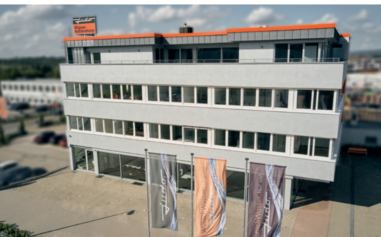
JULIUS DOPSLAFF Campus Winnenden: Training Center