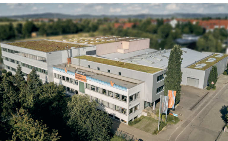
JUDO Waldrems: Development and Production