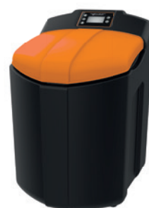
Type Bioquell®-SOFT 40