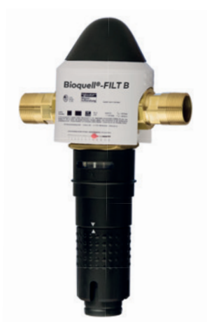
Type Bioquell®-FILT B 3/4" - 1 1/4"