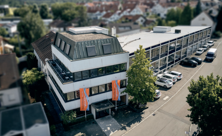
JUDO Winnenden: Administration