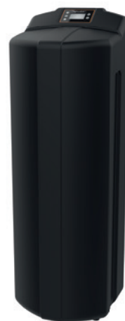
Type Bioquell®-CLEAR 250