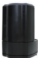
Type FILT-A (Automatic upgrade kit)