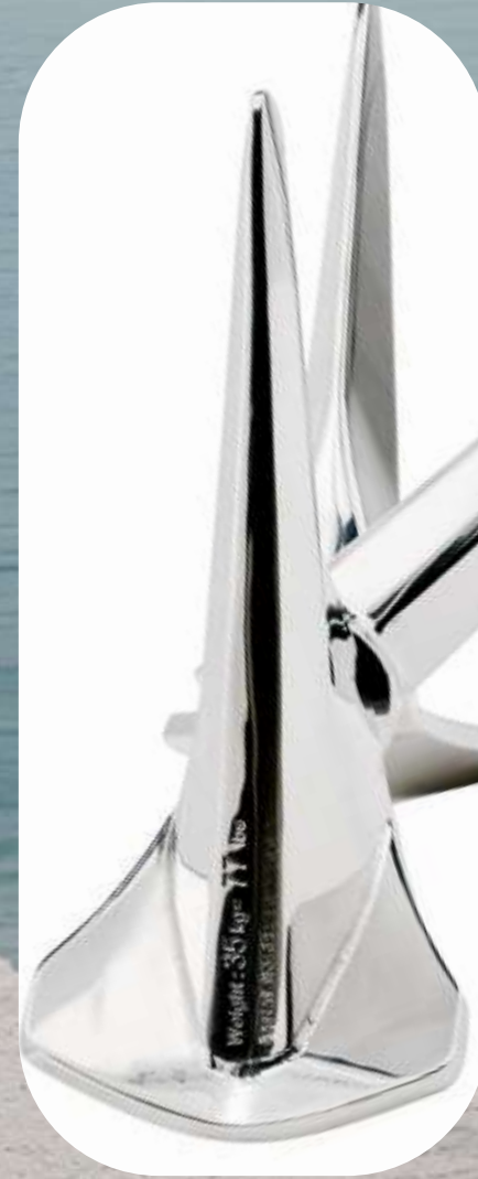
Curved Shoulder Wings