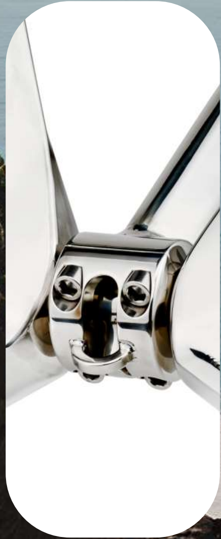
Innovative Joint Design