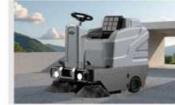
Three-in-one sweeping, vacuuming, and dust suppression, with a cleaning width of up to 1250mm.