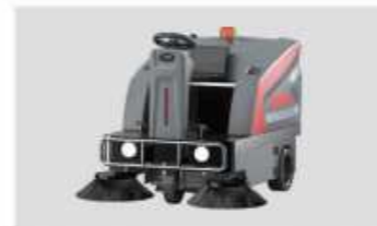
Convertible design, 360° visibility.