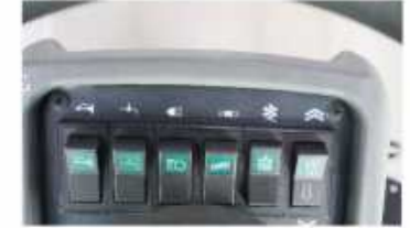
Purely mechanical operation panel, convenient after-sales service.