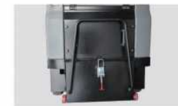
120L trash bin, eliminating frequent emptying and improving cleaning efficiency.