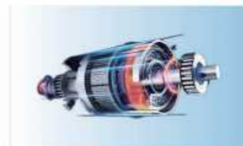
Pure copper vacuum motor, powerful suction, and energy-efficient.