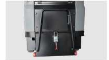
80L trash bin eliminates frequent emptying and improves cleaning efficiency.