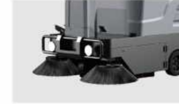
Dual LED headlights, enabling operation even in dark place.