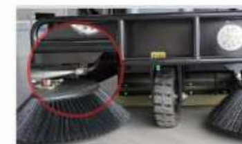
Front spray dust suppression system, effectively reducing the spread of dust.