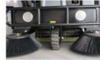
Front anti-collision bumper effectively protects the machine.