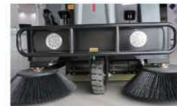
Front anti-collision bumper effectively protects the machine.