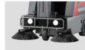
Dual LED headlights, enabling operation even in dark place.