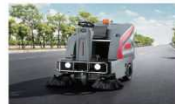
Three-in-one sweeping, vacuuming, and dust suppression, with a cleaning width of up to 1350mm.