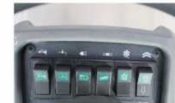
Purely mechanical operation panel, convenient after-sales service.