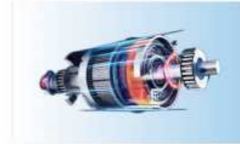
Pure copper vacuum motor, powerful suction, and energy-efficient.