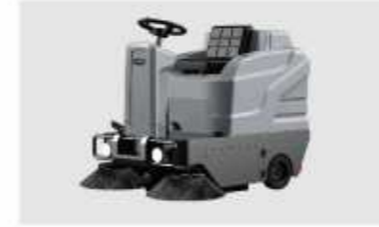
Convertible design, 360° visibility.