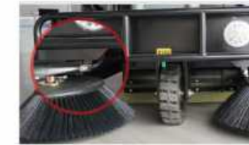
Front dust spray system effectively reduces dust dispersion.