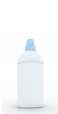
Detergent Bottle 30% Void