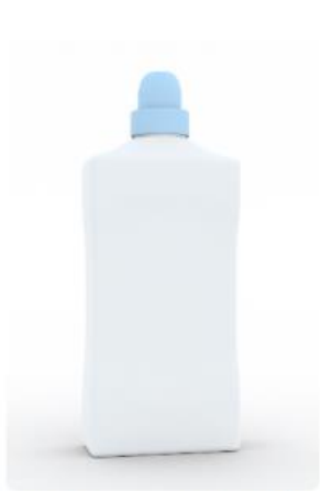
Detergent Bottle 20% Void