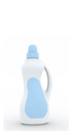
Detergent Bottle 60% Void