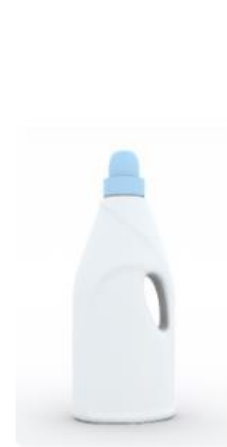
Detergent Bottle 40% Void