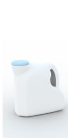
Oil Can 40% Void