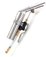
STANDARD UPHOLSTERY TOOL