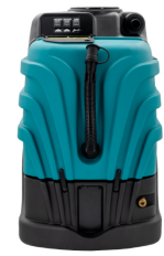
HYDROMIST 40 HM40-120