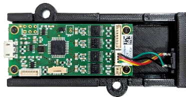
MCR IQ™ 500 assembly