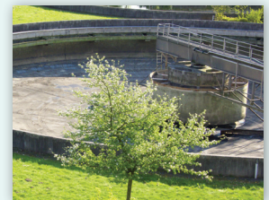
Water & Wastewater