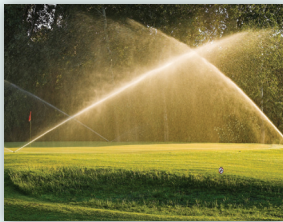
Irrigation & Horticulture