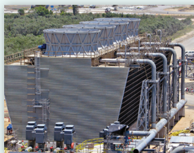
Cooling Tower Water Treatment