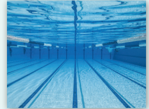
Pool & Spa