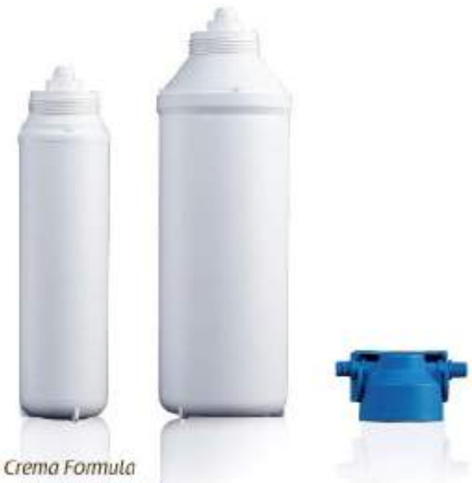
#WM Platform with RM Crema Formula *Recommend product model #RM-17BWM