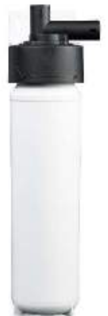
#ECO Platform with PFAS Reduction