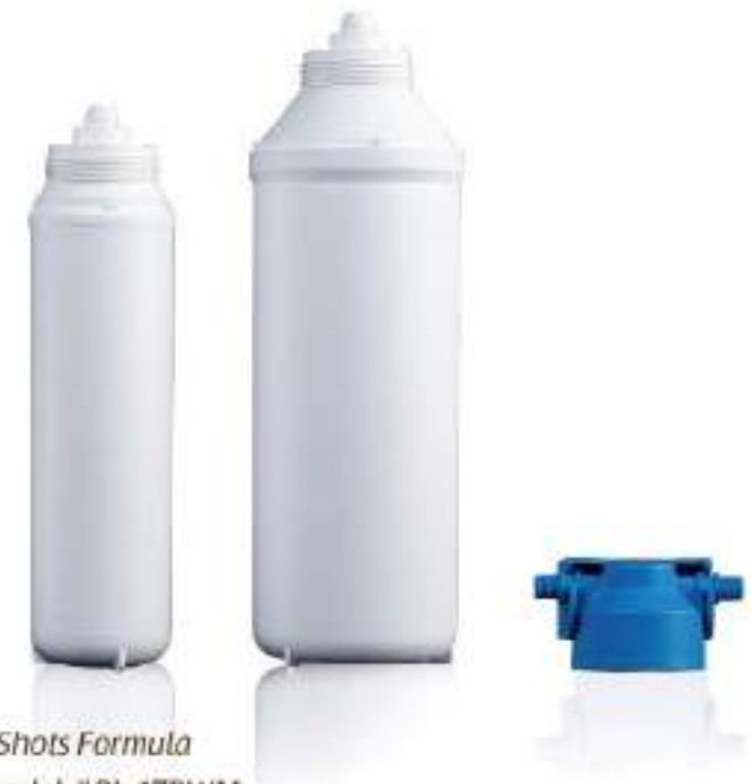
#WM Platform with RL Shots Formula *Recommend product model #RL-17BWM