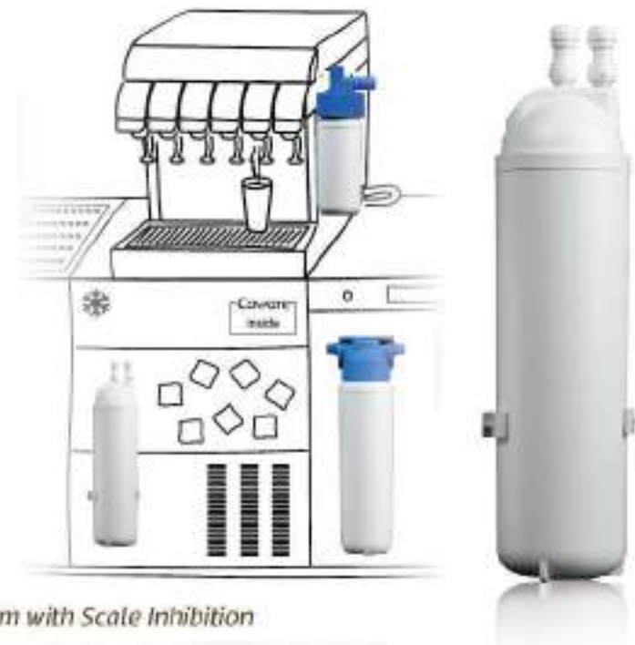
#MCS Platform with Scale Inhibition

*Recommend product model #CBC05-14MCS-SS