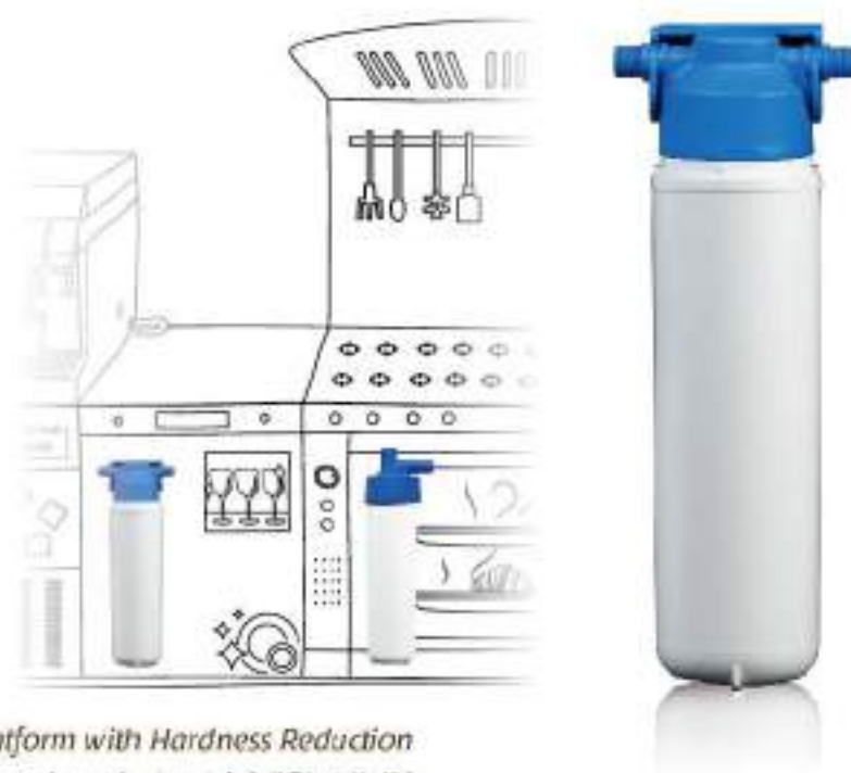
#WM Platform with Hardness Reduction *Recommend product model #RL-14WM *Various product models available upon request