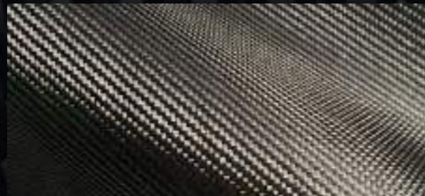
CONVENTIONAL AND THERMO FIXED FABRICS