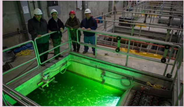
▲ UV treatment process at Chicago wastewater plant.

Nedap's Low Pressure Lamp Drivers have a proven efficiency of at least 95%.