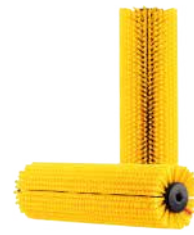
Yellow/ Extra Stiff

Severely matted low loop pile carpets commercial only, with wear indicator. Not for regular use. For "one-time" restorative cleans. Best for extremely matted commercial grade low loop pile carpets.