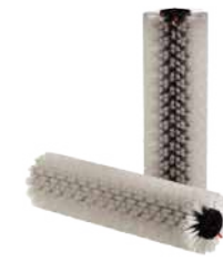
White/ Extra Soft

Residential synthetic fiber cut pile or commercial wool loop pile carpets with diamond sanded tips and wear indicator.