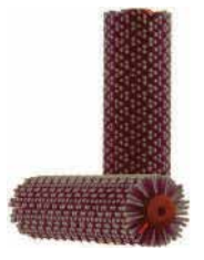
Brown, Special LVT

Soft and delicate natural fibers with wear indicator. Best for soft and delicate carpets.