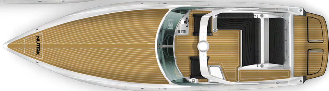
TEAK / WHITE