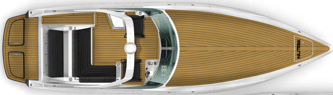
TEAK / BLACK

The resulting rigidity from a thicker plank means that Nuteak XT can be cut and shaped with the same carpentry tools used in the construction of a Burmese teak deck. The Seallock profile with PVC top welding is both stronger and faster than the traditional caulk and sand method. Any necessary training can be provided by ICA Group.