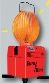
Euro-Blitz LED Synchro