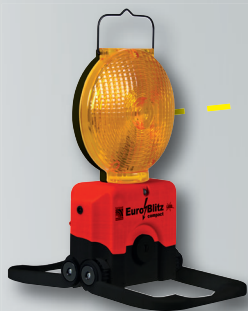
Euro-Blitz compact Synchro

The new horizont SMART-Synchro technology allows combined application of various warning devices of the product family together because they are all compatible.