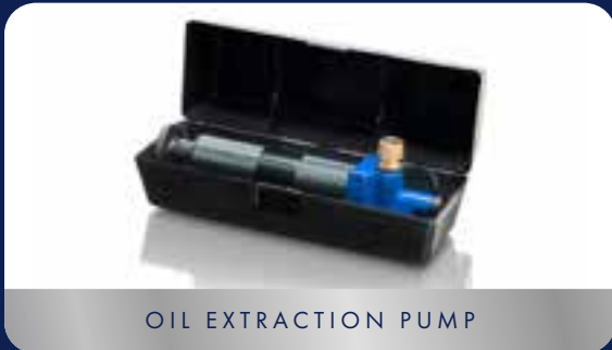
OIL EXTRACTION PUMP