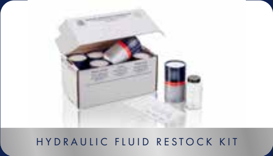
HYDRAULIC FLUID RESTOCK KIT