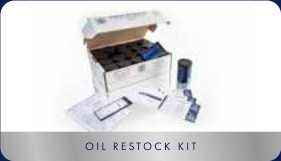
OIL RESTOCK KIT