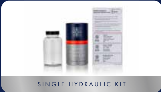
SINGLE HYDRAULIC KIT