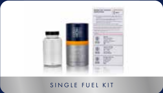
SINGLE FUEL KIT