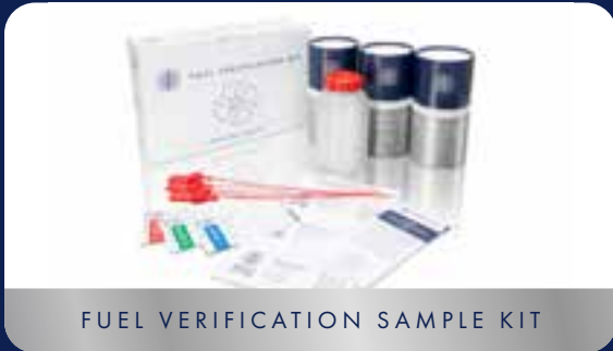
FUEL VERIFICATION SAMPLE KIT