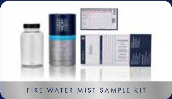
FIRE WATER MIST SAMPLE KIT