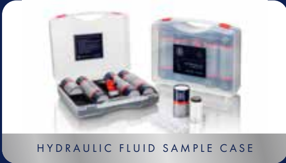
HYDRAULIC FLUID SAMPLE CASE