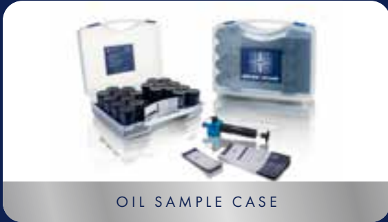
OIL SAMPLE CASE